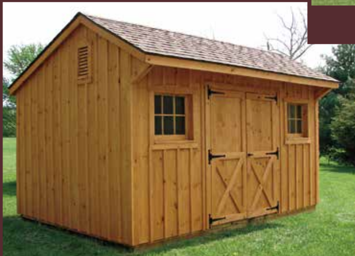
10'X16' QUAKER STORAGE SHED