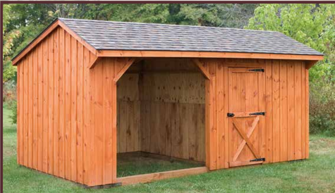
10'X20' RUN-IN / TACK ROOM | optional stain