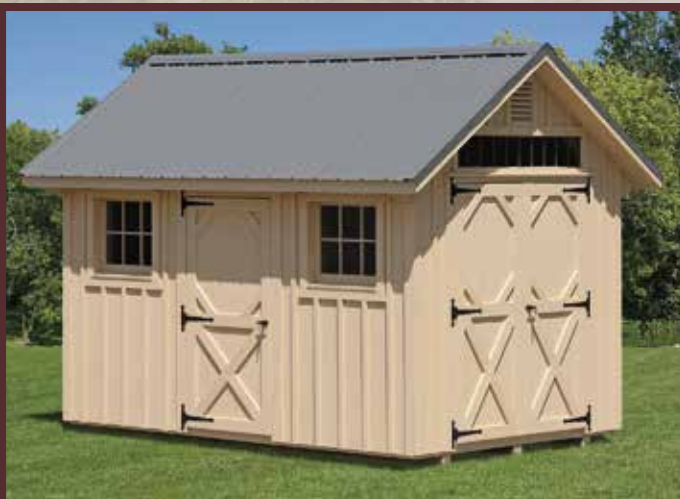
8'X12' GARDEN STYLE STORAGE SHED | stained with metal roof

Our buildings feature extra 2x6 rafter plates.