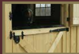
4'x7' Dutch Doors Include heavy duty powder coated strap hinges & decorative hardware.