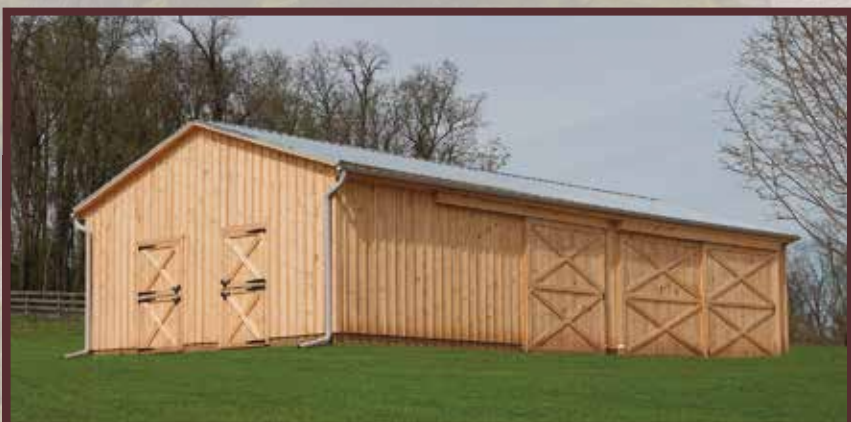
24'X48' BARN | with two horse stalls and storage