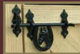
Decorative Horse Latch