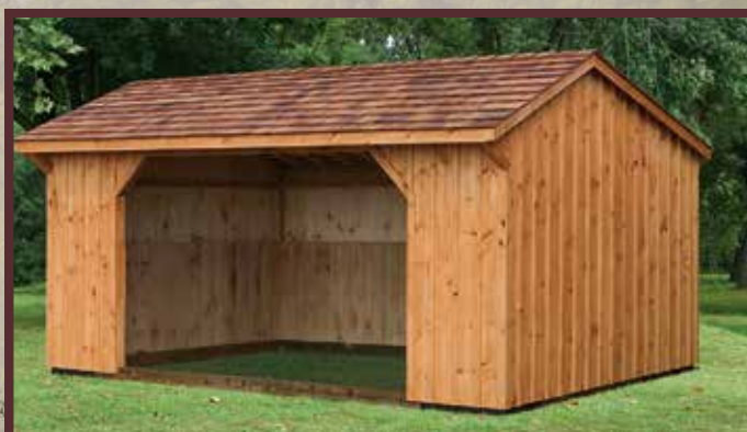
10'X18' RUN-IN SHED | stain & cedar shake shingle roof