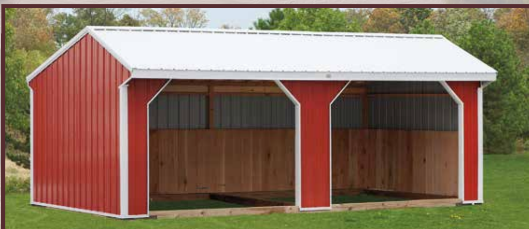
12'X24' RUN-IN SHED | metal siding and metal roof