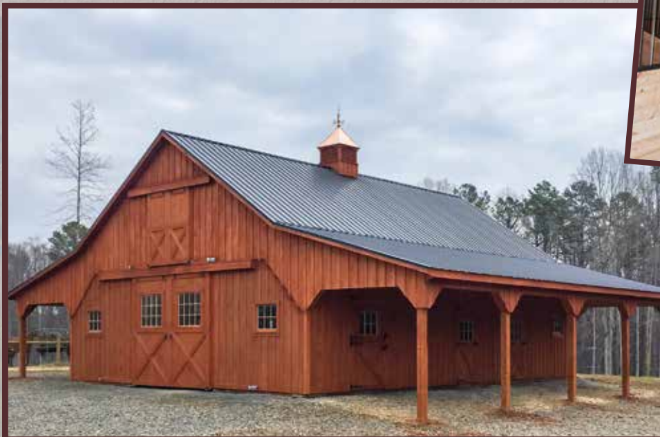
30'X40' | with hayloft and two 10' overhangs