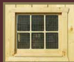
Wooden 6 Lite Window