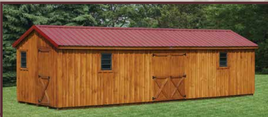
10'X32' A-FRAME STORAGE SHED | stained & red metal roof