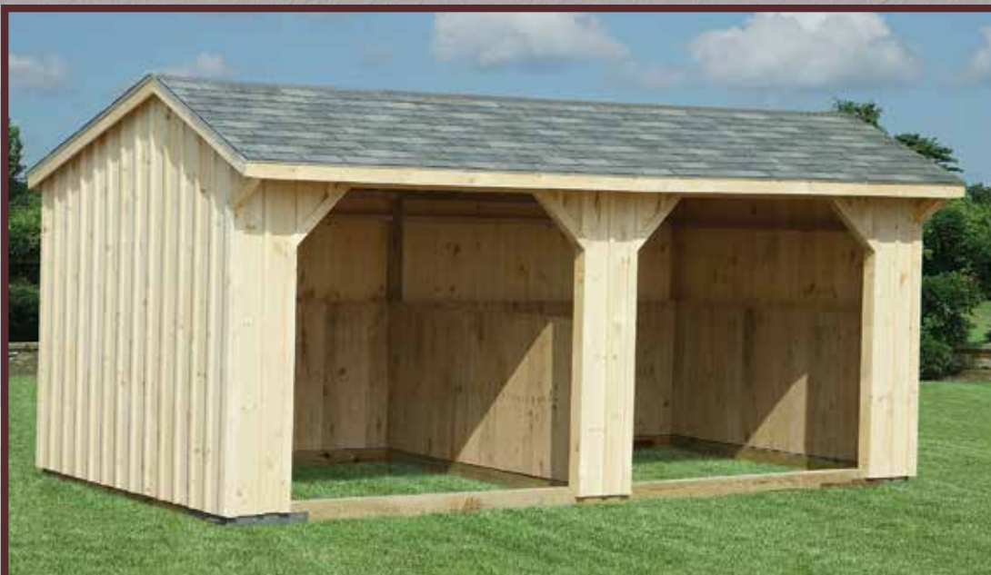
10'X20' RUN-IN SHED | with center divider