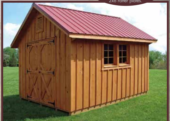
10'X12' GARDEN STYLE STORAGE SHED stained with metal roof