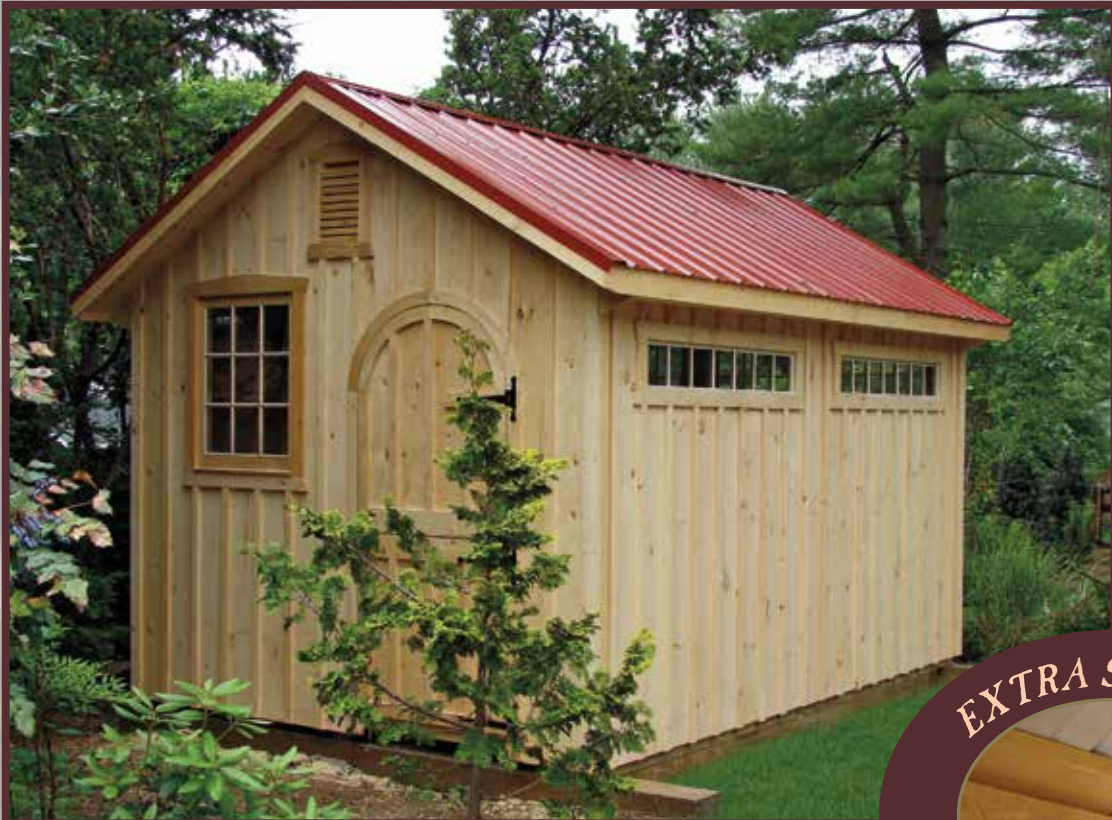
10'X16' GARDEN STYLE STORAGE SHED transom window, metal roof and arched door

feature 10" overhangs and a steeper roof pitch