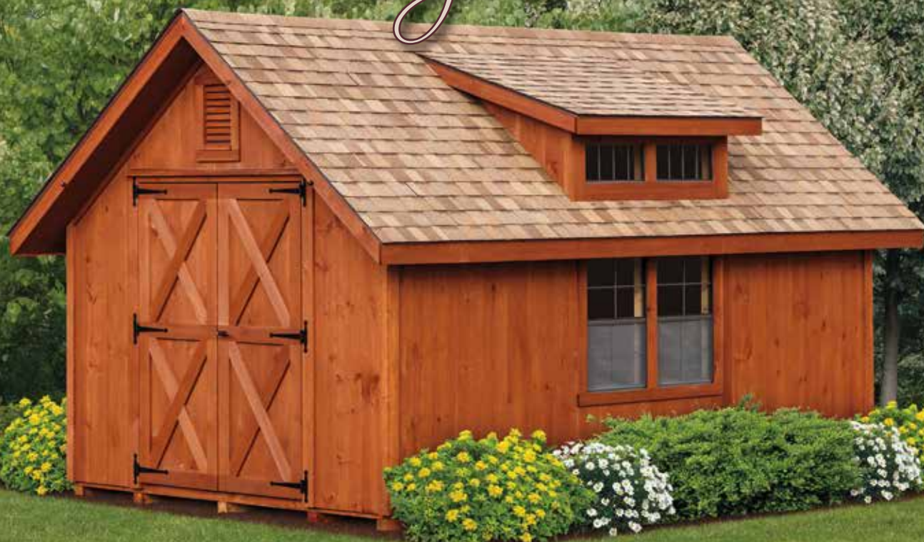
10'X16' VICTORIAN COTTAGE | stained & shingle roof