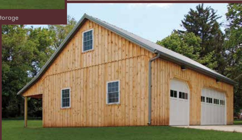
28'X40' GARAGE | with 8'x10' porch