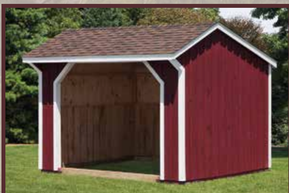
10'X12' RUN-IN SHED | red stain with white trim