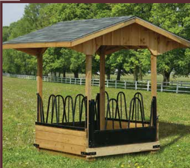
6'X10' HAY FEEDER | Easy to move hay feeder features powder coated corner brackets