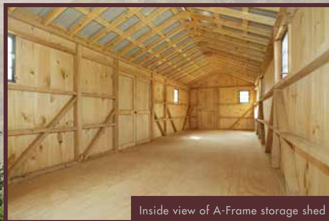
Inside view of A-Frame storage shed