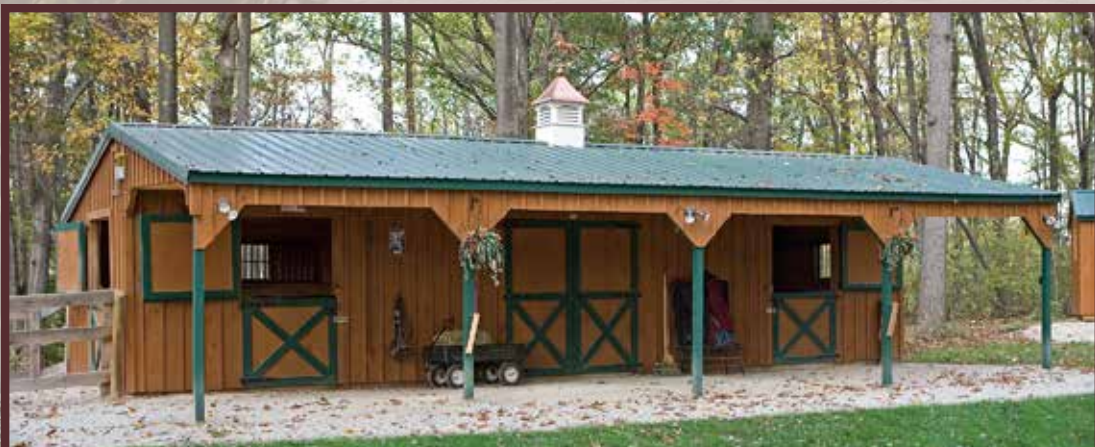
12'X40' SHED ROW | stained and metal roof