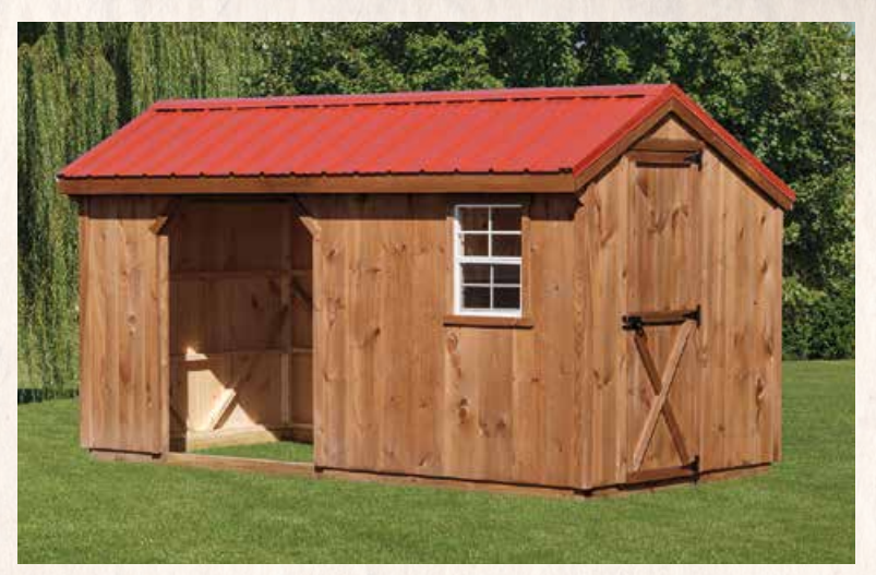
6' x 8' with 4' Feed Room Model RIF68

Shown with mushroom stain and red metal roof