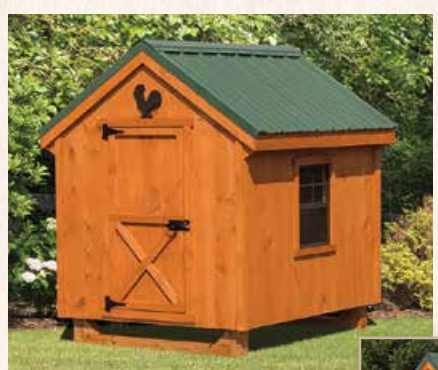
5 x 6 A-Frame • Model AF56 Shown with cedar stain and green metal roof 14–16 Chickens