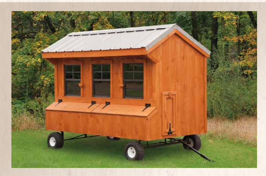
4 x 8 Quaker • Model Q48 Shown with cedar stain and gray metal roof 14–16 Chickens With 4' wide wheel kit