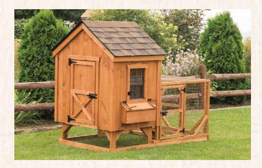
3 x 4 Combination (with 4 x 8 run ) Model C34R

Shown with rustic cedar stain and autumn brown shingles 6–8 Chickens