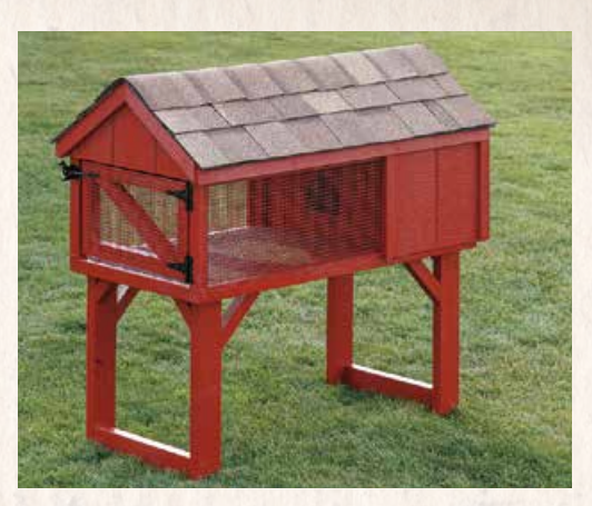
2 x 4 Rabbit Hutch • Model RH24 Shown painted red with sunset cedar shingles