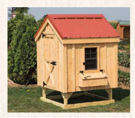
4 x 4 A-Frame • Model AF44 Shown without stain and red metal roof 6–8 Chickens