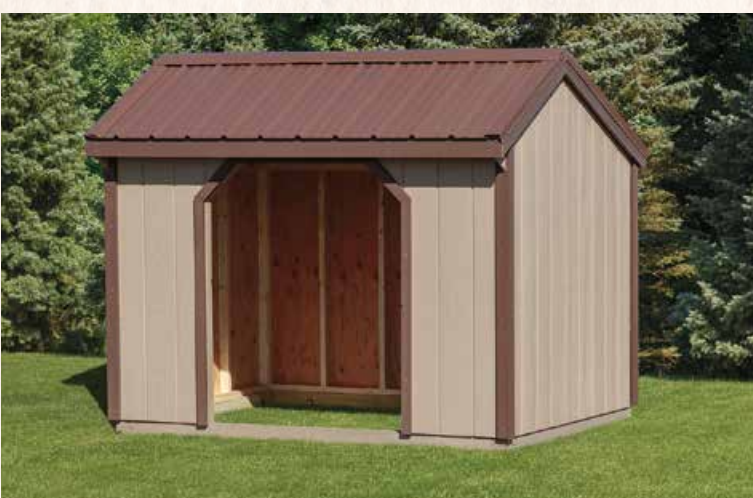
6' x 8' Model RI68 Shown with buckskin paint, brown trim and brown metal roof