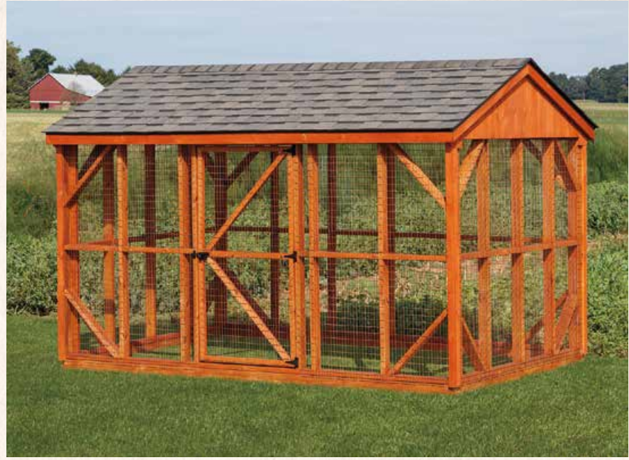
8 x 12 Chicken Run • Model CR812 Shown with cedar stain and fossilwood shingles