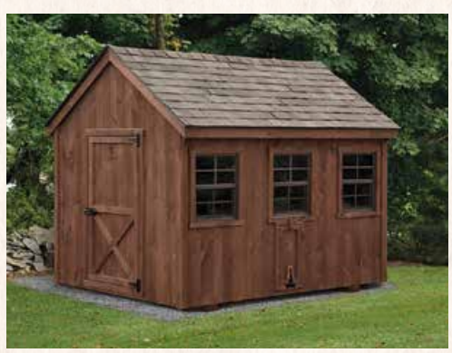
6 x 8 A-Frame • Model AF68 Shown with mushroom stain and fossilwood shingles 18–20 Chickens