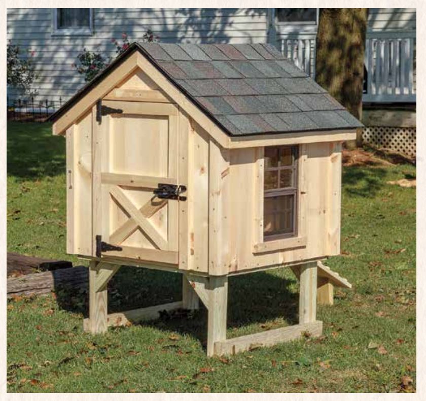
3 x 3 A-Frame • Model AF33 Shown unfinished with fossilwood shingles and one window 2–3 Chickens