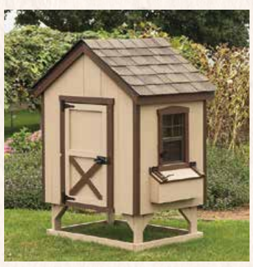
3 x 4 A-Frame • Model AF34 Shown with buckskin paint, brown trim and fossilwood shingles 4–6 Chickens