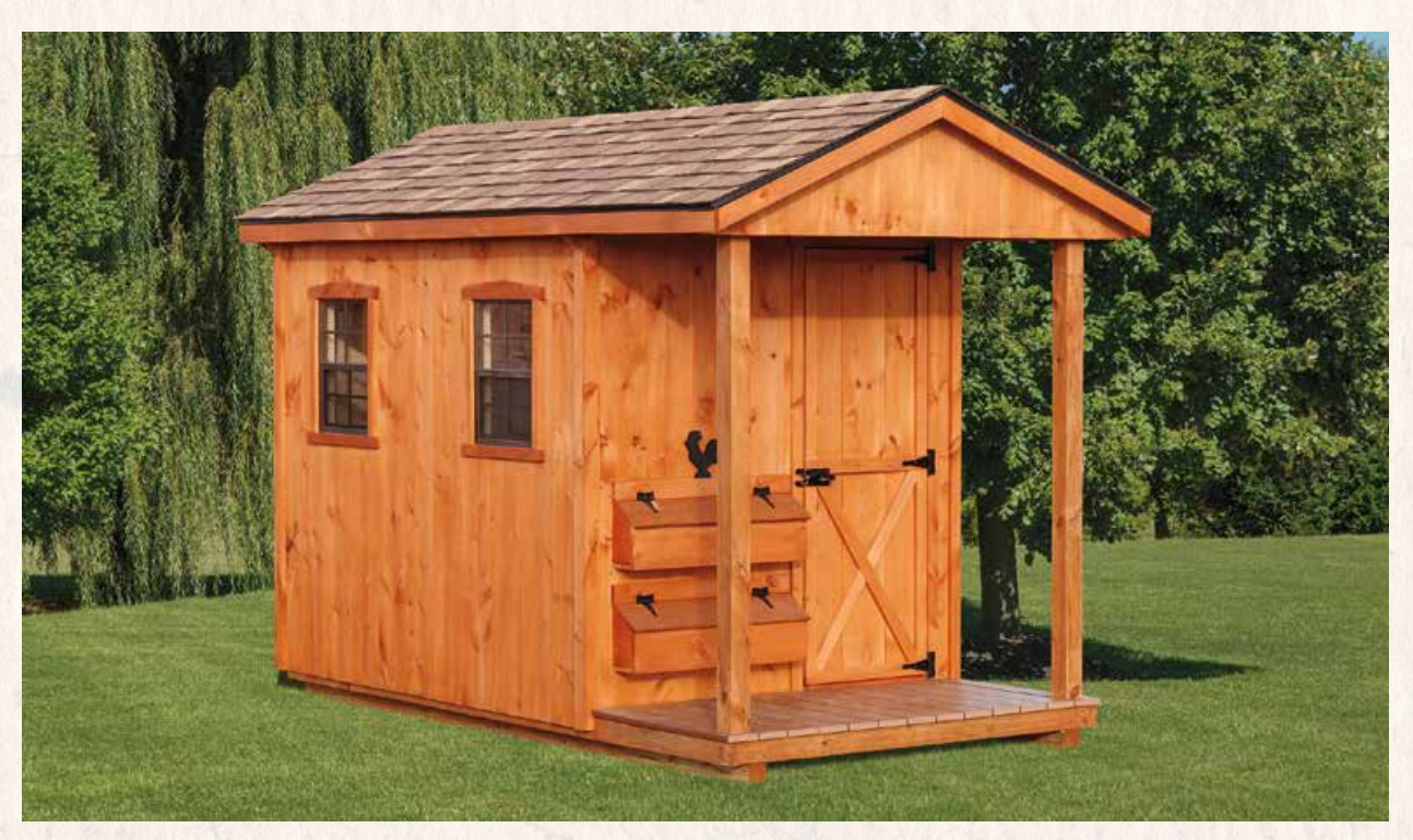
6 x 8 A-Frame with 3' Porch • Model AFP68 Shown with cedar stain and sunset cedar shingles 18–20 Chickens