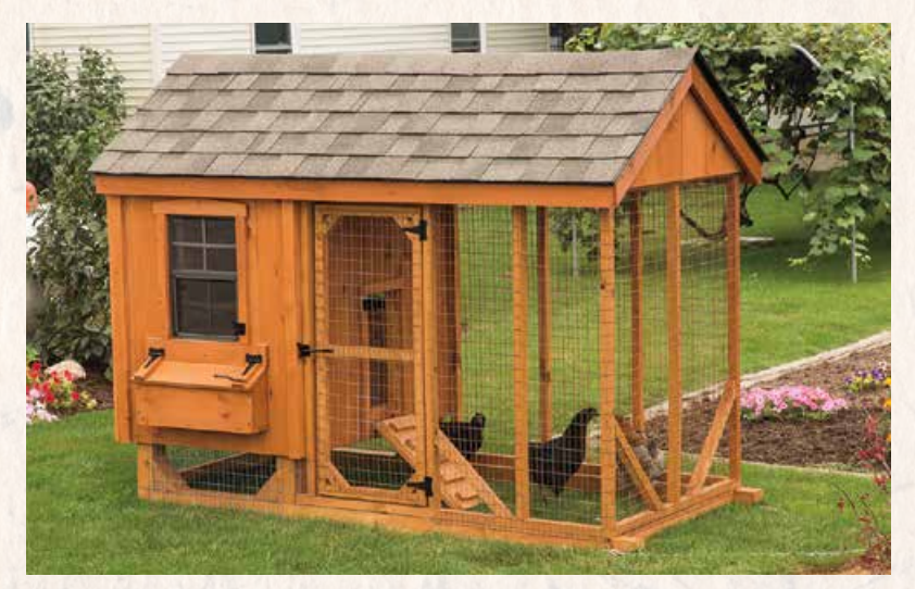
4 x 8 Combination Model C48

Shown with cedar stain and fossilwood shingles 4–6 Chickens