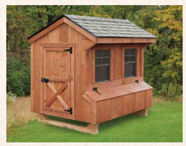
4 x 6 Quaker • Model Q46 Shown with cedar stain and fossilwood shingles 10–12 Chickens