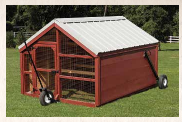
6 x 8 Chicken Tractor • Model T68 Shown with red paint and gray metal roof 16–20 Chickens Custom sizes available