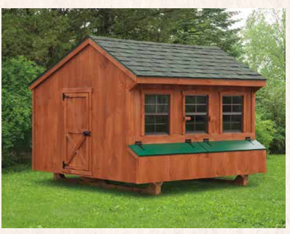
8 x 8 Quaker • Model Q88 Shown with rustic cedar stain and boreal green shingles 30–32 Chickens