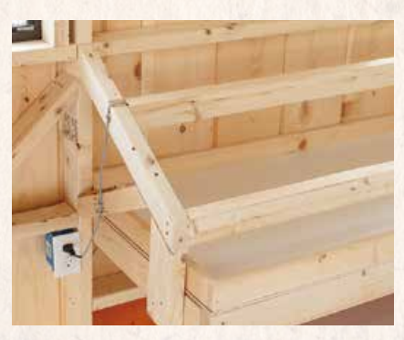
Heated roost and litter tray