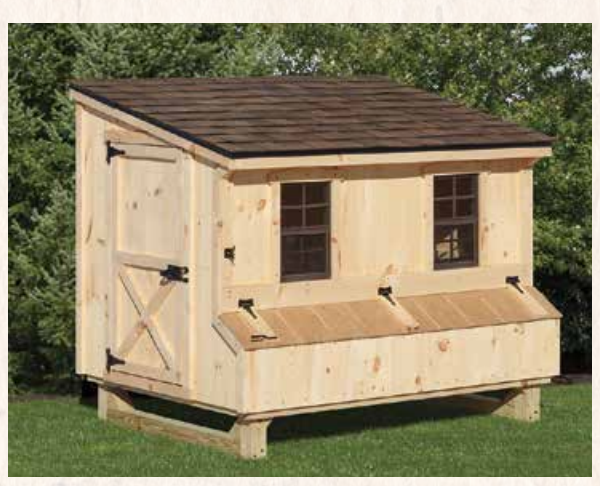
Lean-to Style • Model LT46 Shown unfinished with autumn brown shingles 10–12 Chickens