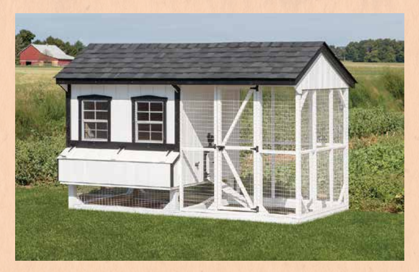
6 x 12 Combination Model C612 Shown with white paint, black

Shown with white paint, black trim and shadow black shingles