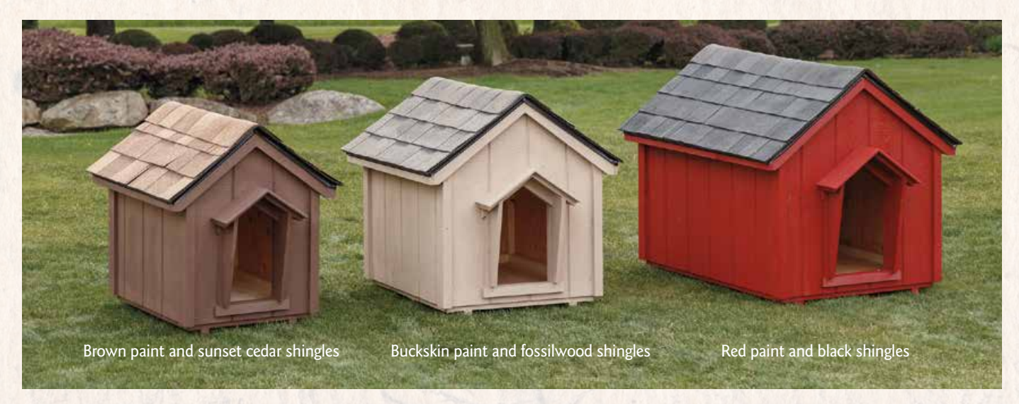
Small, medium and large dog houses