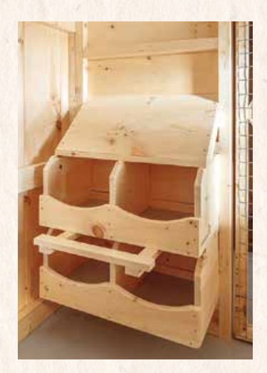
Nest boxes on feed room wall