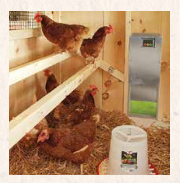
Automatic chicken door