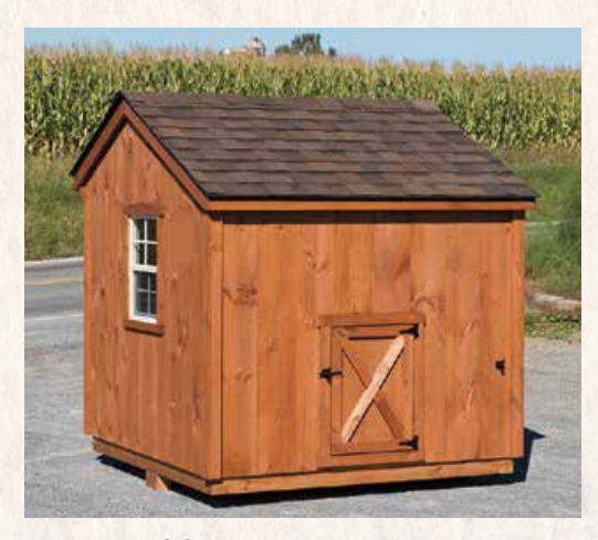
6' x 6' • Model GP66 Rustic cedar stain with autumn brown shingles