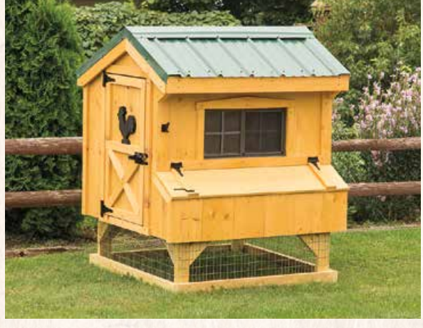
3 x 4 Quaker • Model Q34 Shown with natural stain and green metal roof 4–6 Chickens